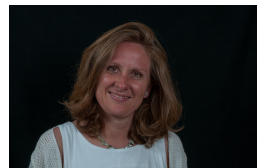
M. Intl. Com. BSc. (Nutri.) Europe